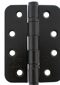
Product Finish Pictured: Matt Black